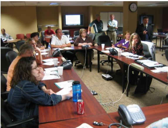
Regional Mass Fatality Disaster Behavioral Health Table Top Exercise (DIRE PLAY 5.2) – May 2011

Mission: Our goal is to provide our regional partners with access to information, training and specialized services in emergency preparedness by coordinating with local, state and national agencies.