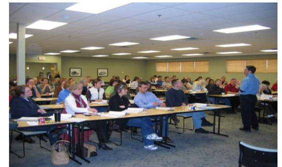
Critical Incident Stress Management (CISM) Training March 2008

Meetings are held the 1 st Tuesday of every month, 9:30 – 10:30am. Teleconferencing is available.*